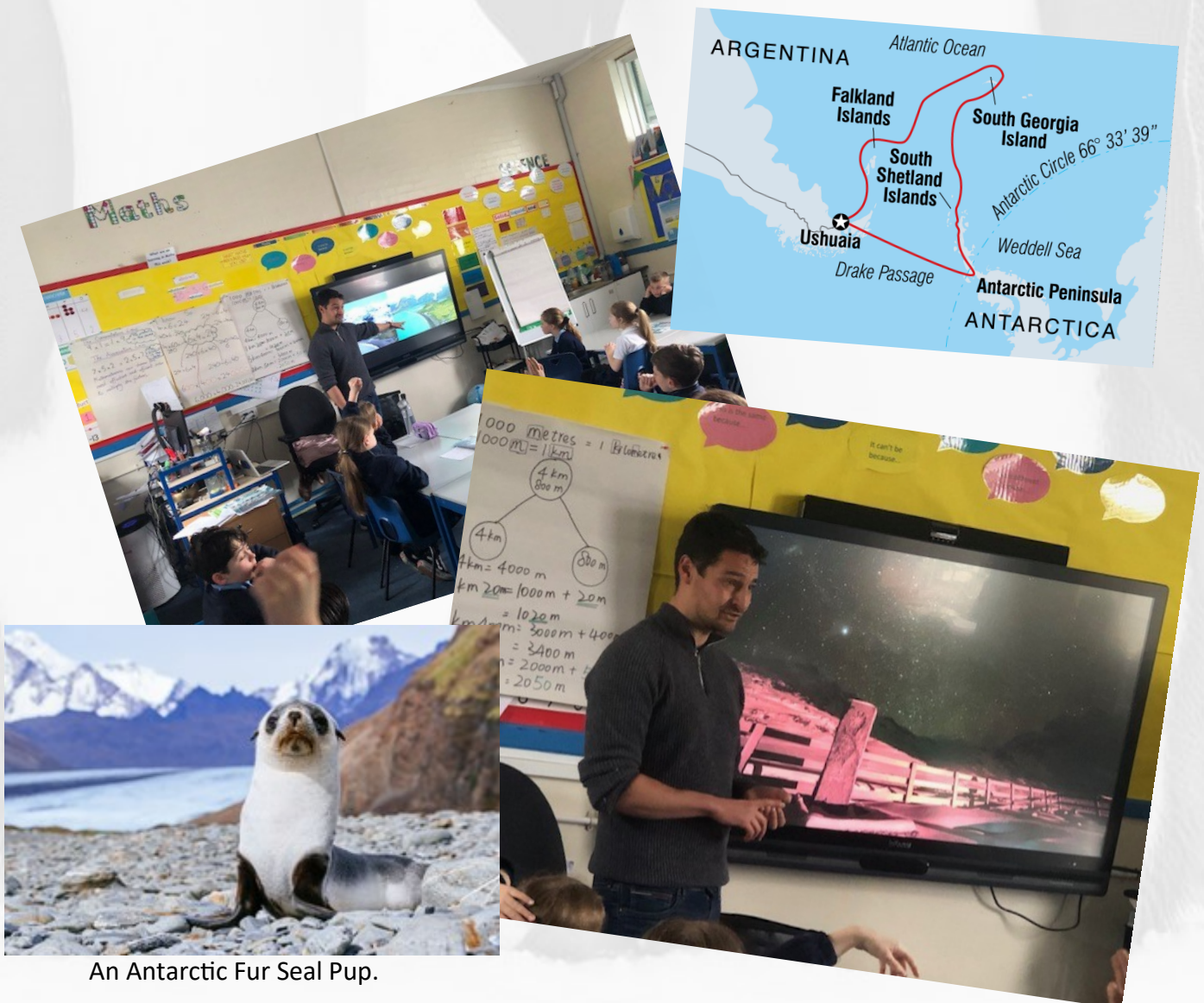
An Antarctic Fur Seal Pup.